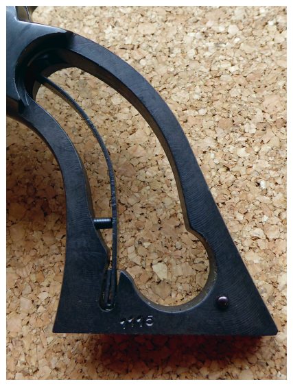
The mainspring is slotted into the frame

Uberti has created a very faithful rendition of the Remington NMA revolver. The black on the barrel, frame and cylinder has a nice even gloss finish and all metal edges are crisp. The two-piece stocks fit very well and are finished in Uberti's regular red/brown varnish. You will notice an assembly number stamped into the frame