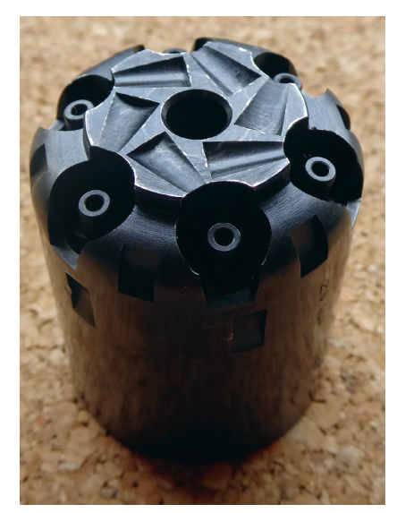
The rear of the cylinder, note the safety notches and angled nipples

production of this model, some 6.000 units, went to the Army.