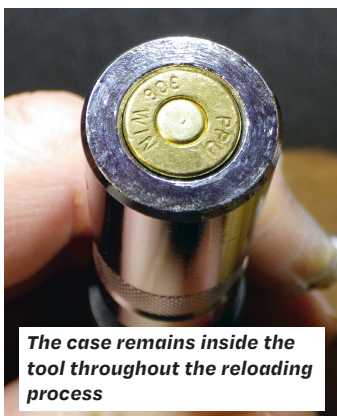
The case remains inside the tool throughout the reloading process