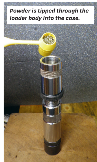
Powder is tipped through the loader body into the case.