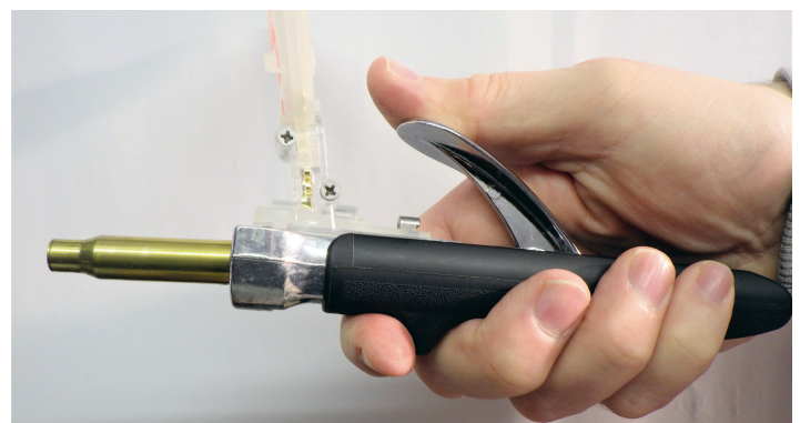
This tool is very comfortable to use and seats primers easily