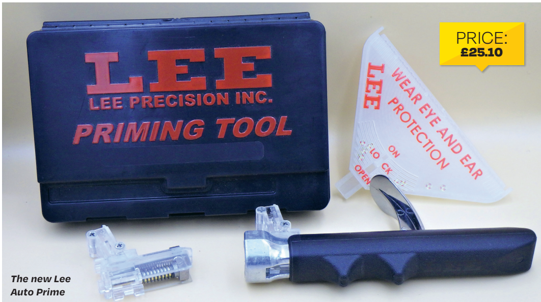
The new Lee Auto Prime

➤ The Lee Precision Auto-Prime hand-held priming tool has been around for a long time in a number of versions, evolving considerably over the years, and they have all been effective tools. So, what does the latest offering, the 'New Model', have that previous versions lacked?