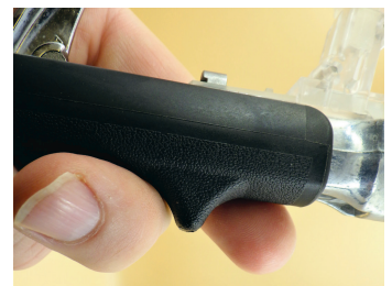
The very grippy plastic grip has deep finger grooves to give a very firm and comfortable hold

with harder primers, which are often more difficult to seat, you can still press them home easily and feel them bottom out in the primer pocket.